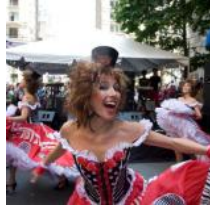
June's best things to do