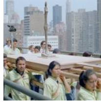
Review: "Francis Alys: A Story of Deception"